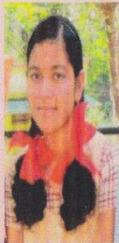
Tincy mol L (full A+)